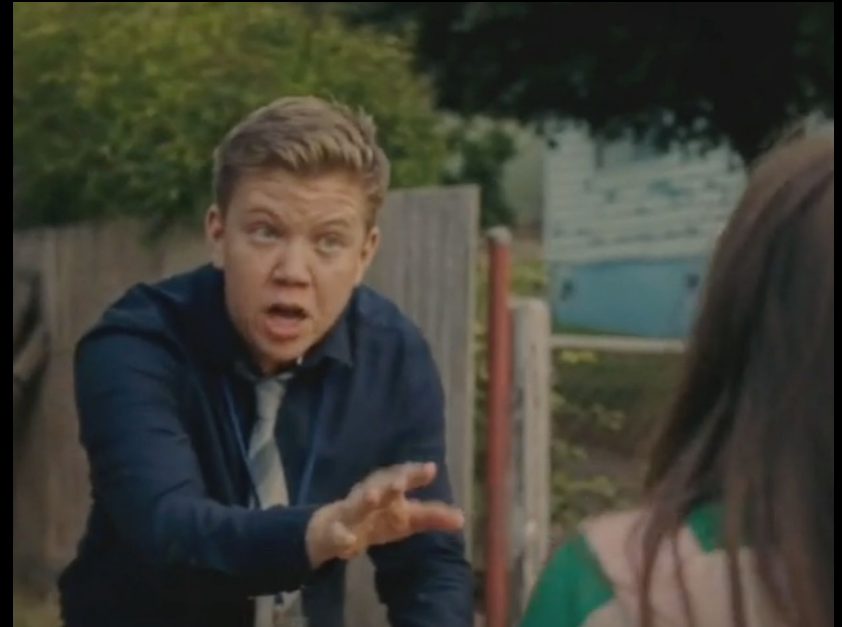
As Detective Jones in My First Summer (STAN)