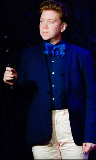
As George Holly in Suddenly Last Summer