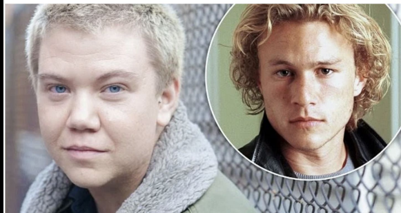
The Daily Mail, 2018

By Candice Jackson For Daily Mail Australia 02:52 21 Aug 2018, updated 04:15 21 Aug 2018