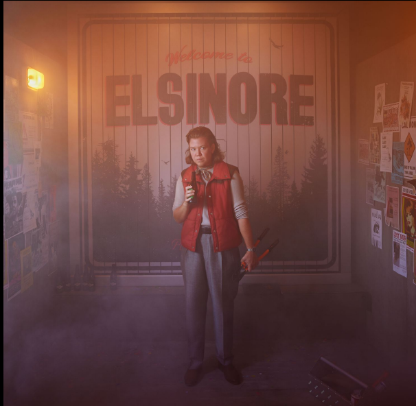
As Laertes in Because the Night