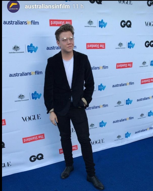
The Standard Hotel, HLS 2018