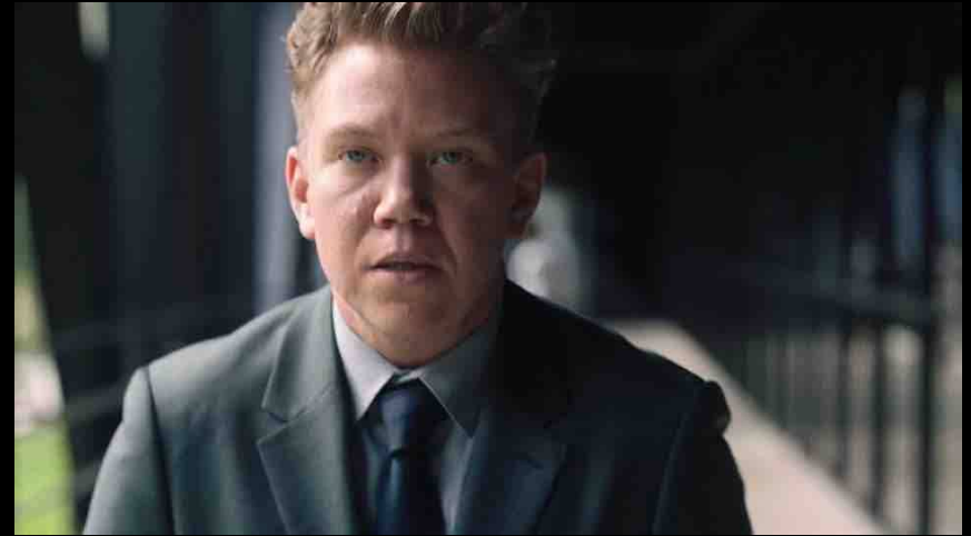
As Abel in Don't Look Deeper